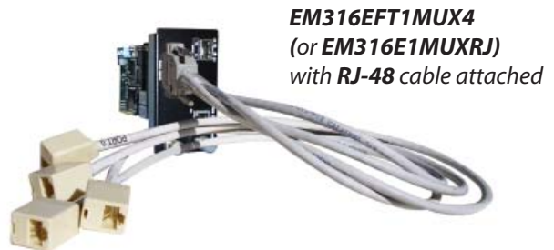
EM316EFT1MUX4 (or EM316E1MUXRJ ) with RJ-48 cable attached