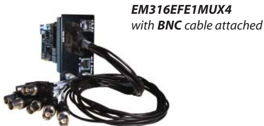
EM316EFE1MUX4 with BNC cable attached

Contact an authorized MRV representative for more information on E1/T1 multiplexers and other Fiber Driver products.