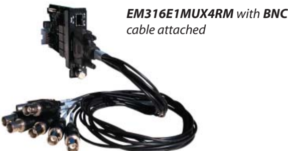
EM316E1MUX4RM with BNC cable attached

Contact an authorized MRV representative for more information on E1/T1 multiplexers and other Fiber Driver products.