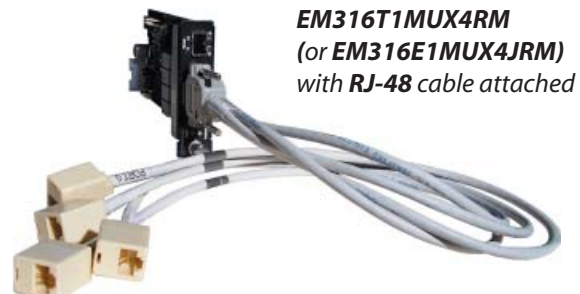
EM316T1MUX4RM (or EM316E1MUX4JRM) with RJ-48 cable attached