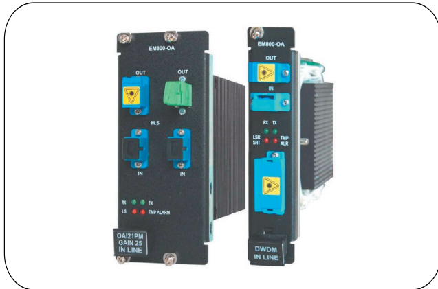
Optical Amplifier modules