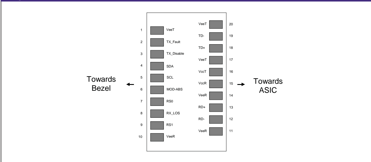
Diagram of Host Board Connector Block Pin Numbers and Names