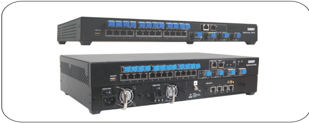
OS940 and OS940-M