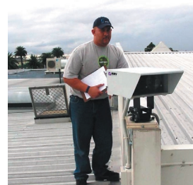
Ethernet optical wireless link seen from Computer